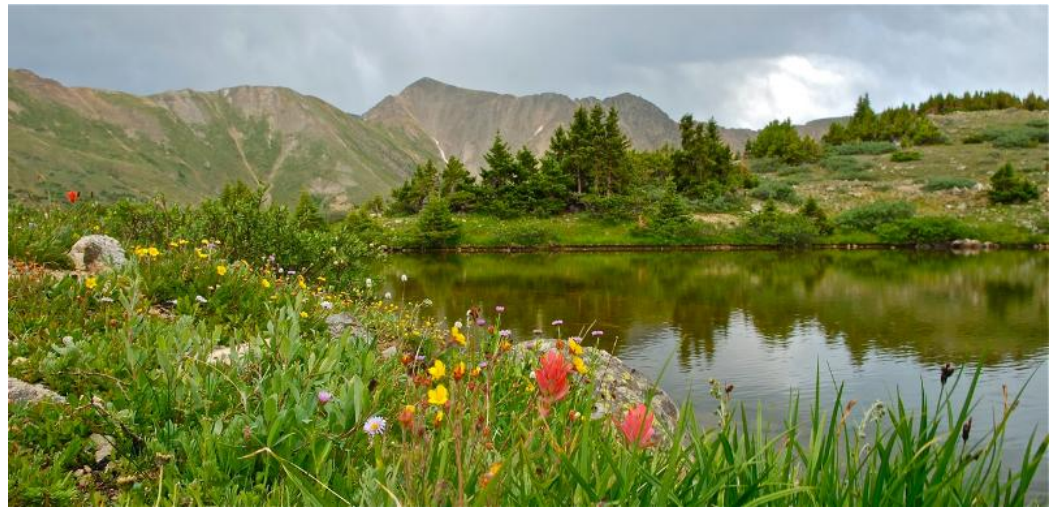
Keystone Mountains in Colorado - the location of the 2013 AANP conference. Register here.